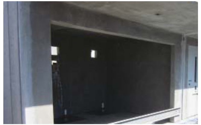
Building Structures Market - Precast Cells & Shower Modules