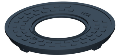
Cast Iron Ring