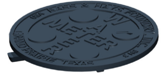
Cast Iron Cover