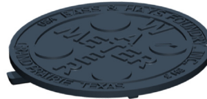
Cast Iron Cover