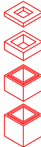
ISO VIEW SCALE: 3/32" = 1'-0"