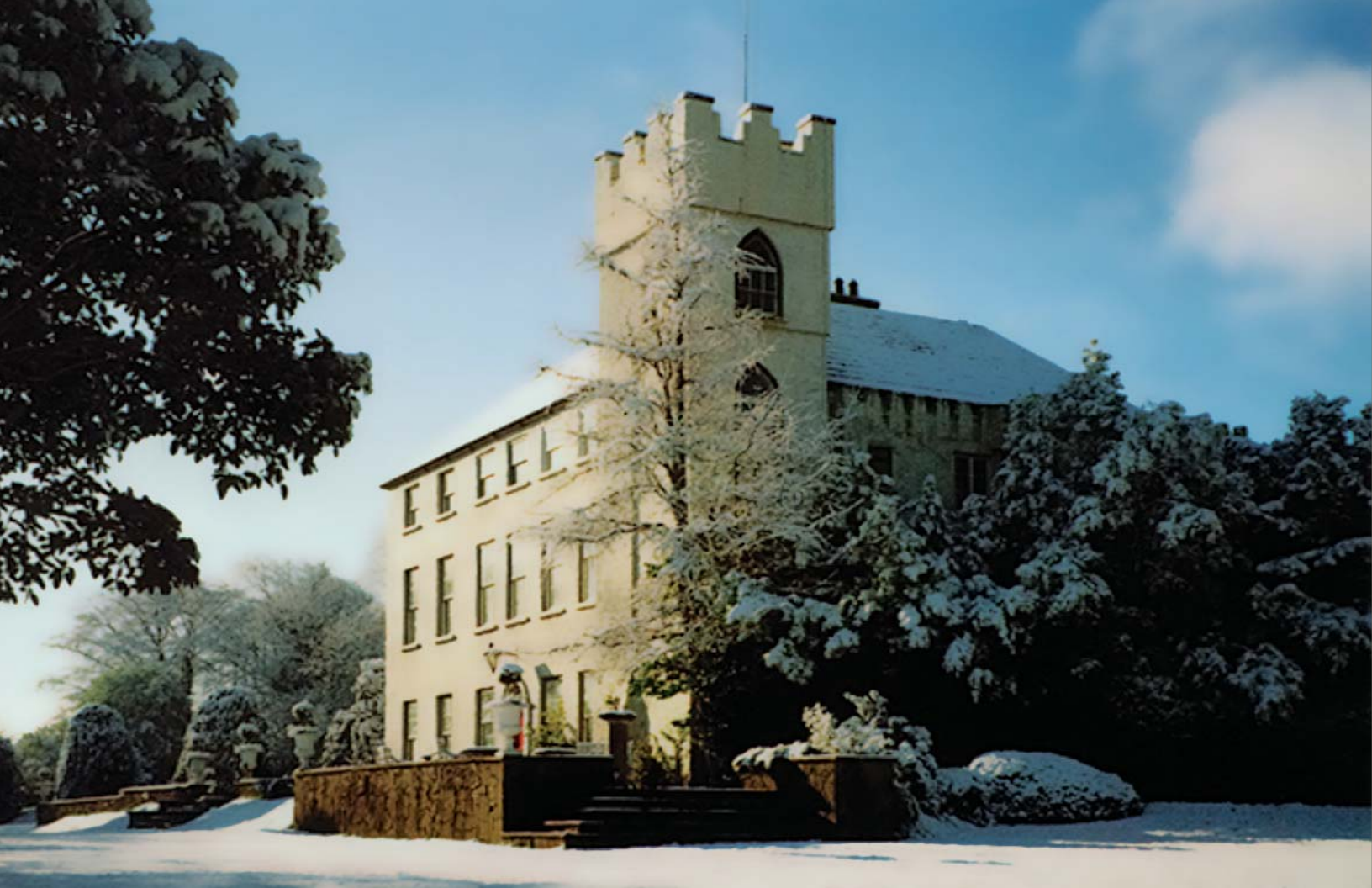
CRH Belgard Castle