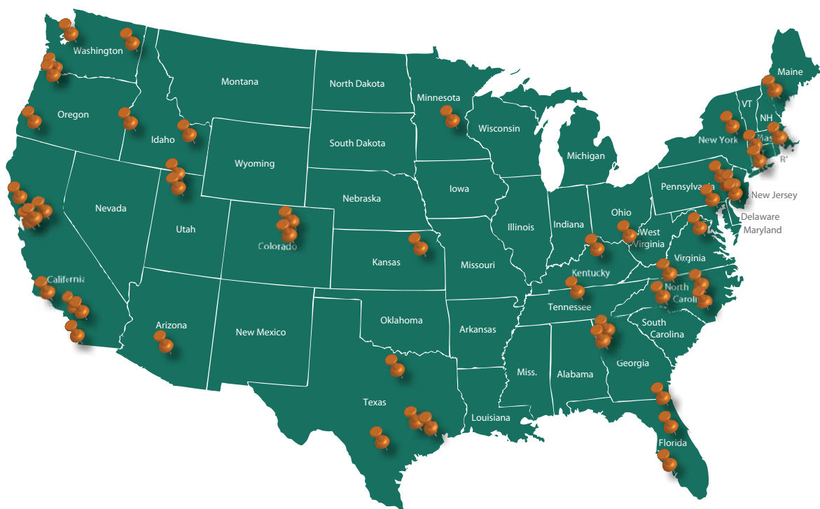
Oldcastle Precast U.S. Manufacturing Plants