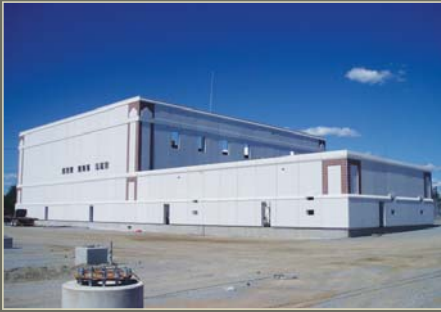
Power & Energy