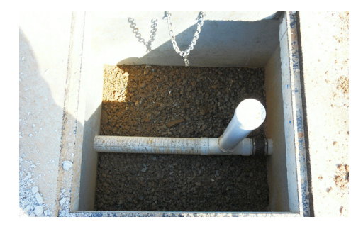
Looking down into the empty unit, the drainage pipe is installed and the BioPod is ready to receive a tree and be filled with planting/ filtration medium.

Cutaway illustration of a BioPod biofiltration unit. Pollutant-heavy stormwater runoff enters the curb inlet at the top. Large debris collects in the pretreatment chamber. As water travels downward, pollutants are filtered out by planting media. The tree gets water and nutrients from the collected runoff. Filtered water is collected by the perforated pipe at the bottom and carried out of the unit to the drainage system.