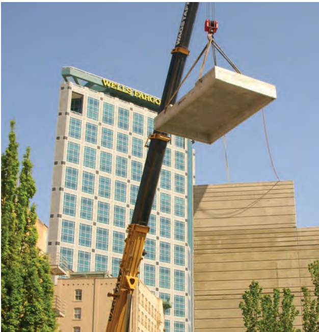
Installation of panel vault system.

We can provide drawings and calculations stamped by a professional engineer.