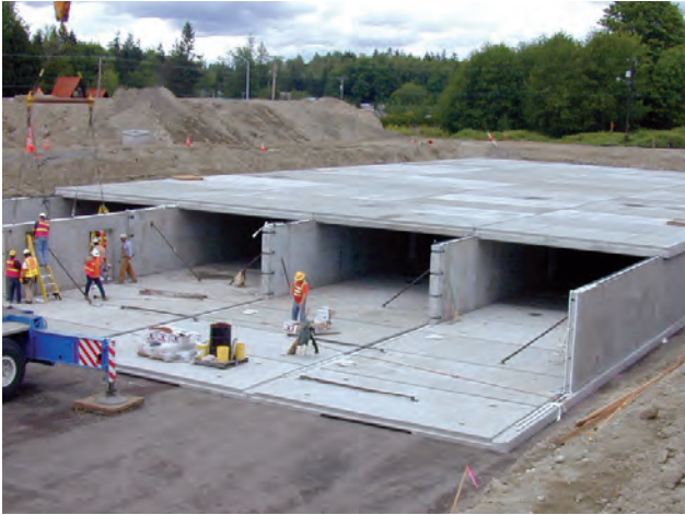
Oldcastle designs and manufactures panel vaults.

Oldcastle Infrastructure designs and manufactures panel vaults as a unique solution for building custom stormwater detention systems onsite. A panel vault provides the flexibility to construct independent wall sections with blockouts and knockouts as required. We manufacture all of our panel vaults in a quality controlled environment and then transport them to the project site for installation which allows the contractor to save the time and money required to cast the structure in place.