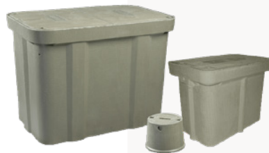
OLDCASTLE POLYMER Polymer Concrete Enclosures