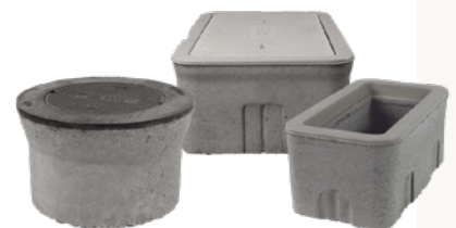
CHRISTY ® Concrete Enclosures

Visit oldcastleinfrastructure.com for more product specific information.