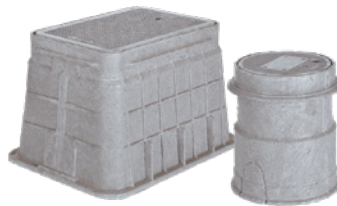
FIBRELYTE ® Composite Enclosures