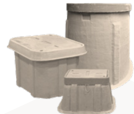
OLDCASTLE FRP Fiberglass/Polymer Enclosures