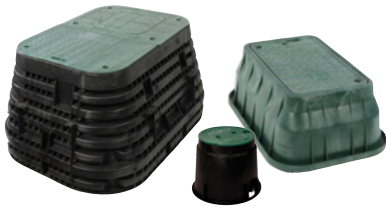
CARSON ® HDPE Enclosures

Oldcastle Infrastructure is focused on material diversity to provide you with the right enclosure for your specifications and project application needs.