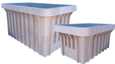
DURALITE ™ Composite Enclosures