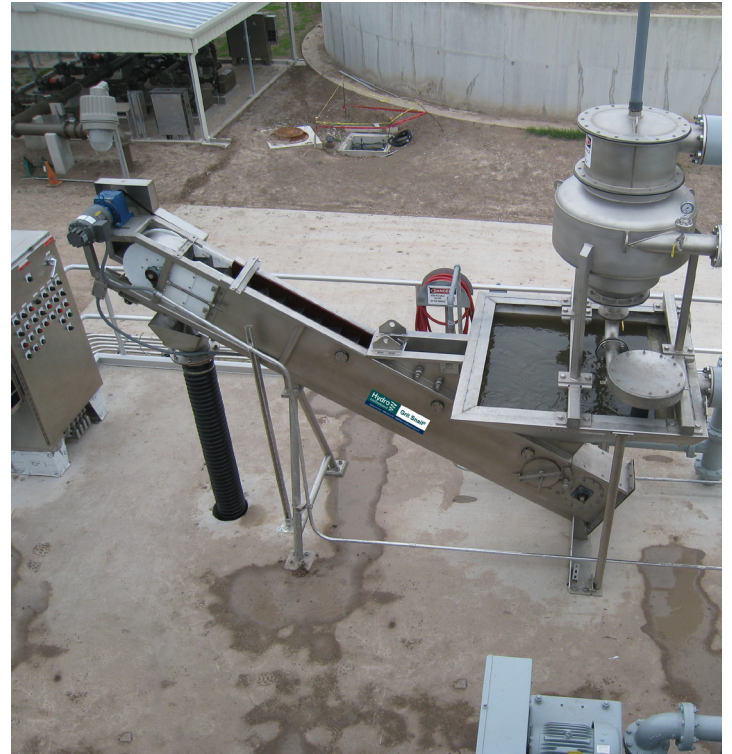
Installed TeaCup® / Grit Snail® system