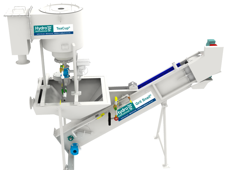
TeaCup® / Grit Snail® washing and dewatering system