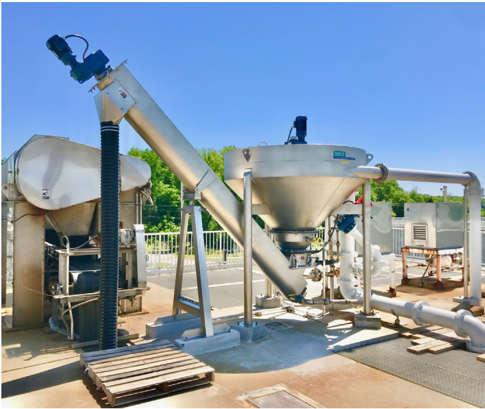
Operating Hydro GritCleanse™ System