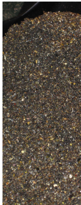
Conventional Grit Washer Output >50% VS