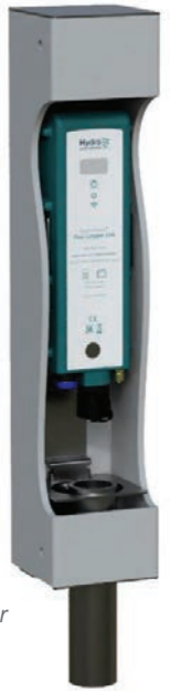
Fig. 3 Hydro-Logic® Flexi Logger 105 in our standard pole-top enclosure.