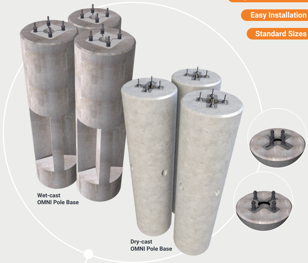
Wet-cast OMNI Pole Base