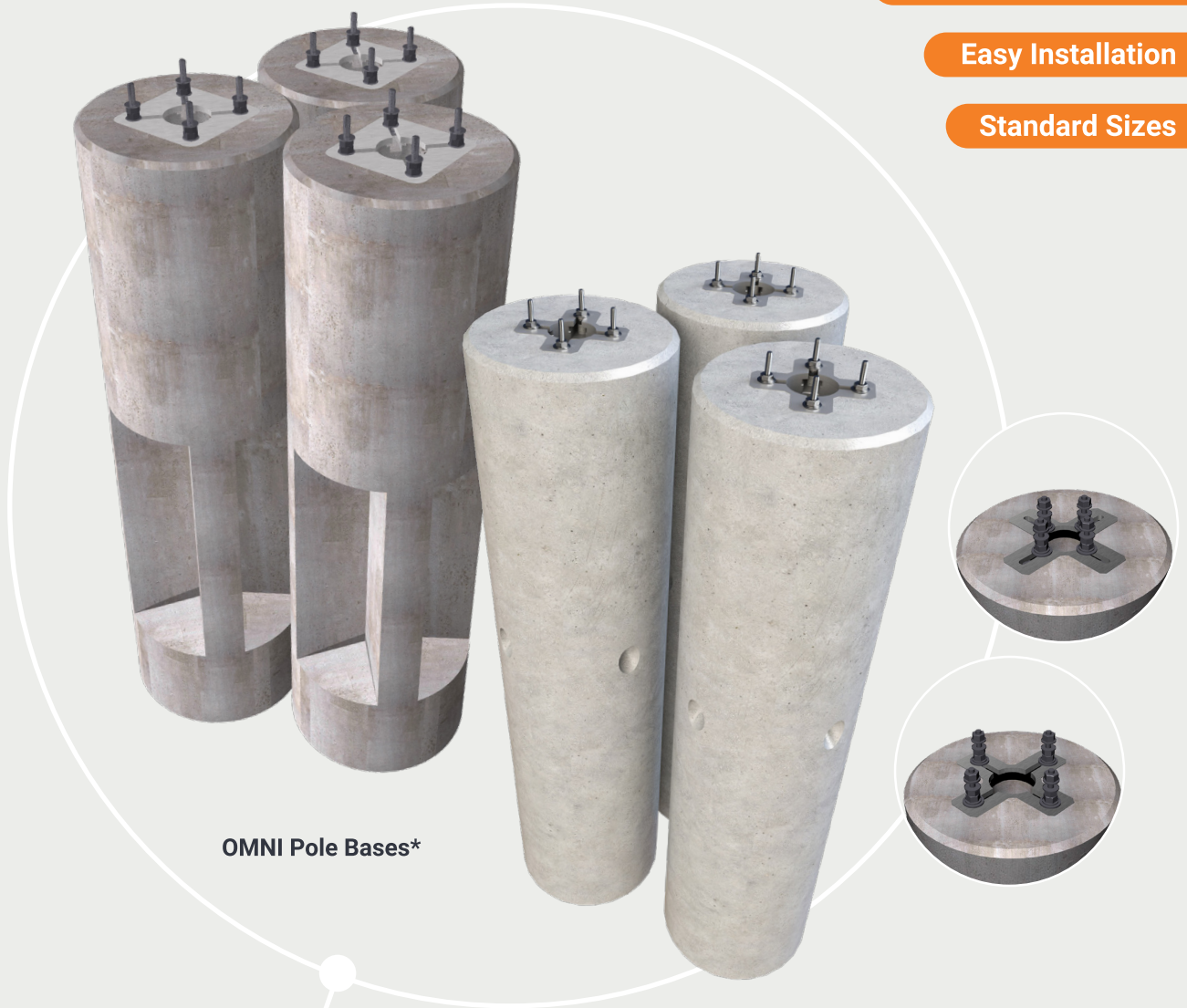
OMNI Pole Bases*